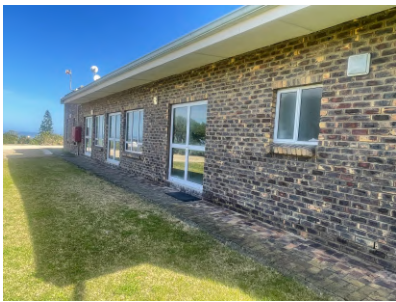
The Brenton Community Hall Annex where we currently meet for church.

Our church has finally moved into a more stable location. We are renting at the Brenton Community Hall. Although we can only use the annex room, it has been nice to have meetings in the same place every week. Please continue your prayers for our church. It seems as though some of our families are under constant attack and there are many opportunities for counseling. We are encouraged by consistent steady growth in our membership both numerically and spiritually. We continue to look for a meeting place, but it has been elusive thus far.