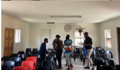
Notice the building improvements in these two photos taken at My Father's House Baptist Church