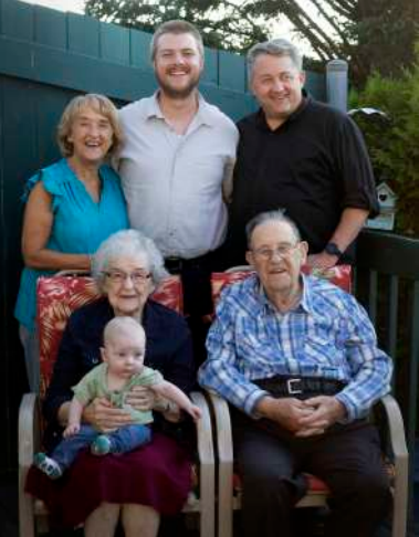
We took this 5-generation photo with Grampy the last time we were in Canada.