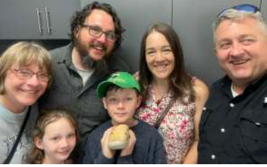
The Straubs were in town from Zambia and we got to connect!