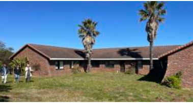
The guesthouse portion of the property which could be used as a Sunday School building