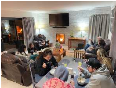
A visiting missions team from Maryland joined us for dinner one chilly evening in July.