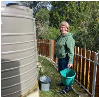
We had no water for 2 days so we filled buckets from rain water tanks behind our house.