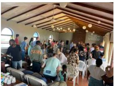
We are now meeting at the Oceanview Lodge.